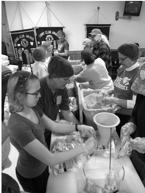
Packaging Meals for "Rise Against Hunger"