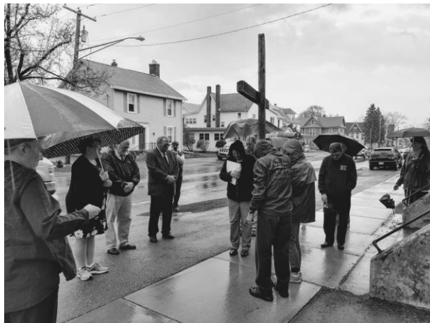
Cross Walk Through Centre Hall